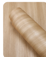
White Mountain Oak