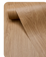
Classic American Oak*