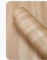
White Mountain Oak