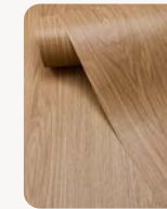
Classic American Oak*