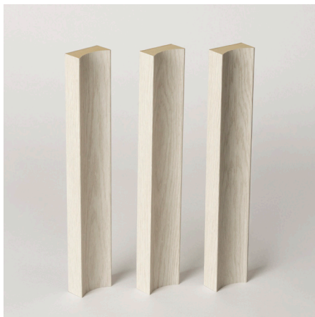
Stix® MR Fluted 2550 shown in NAVURBAN Diamond™ Vanilla Bean

Fluted 2550 prefinished, loose decorative battens enable you to explore dynamic architectural wall shapes, ceilings, custom joinery, and seamless finishing.