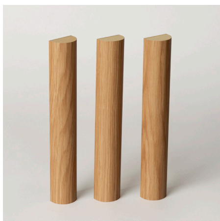
Stix® MR Half-Round 3250 shown in NAVURBAN Diamond™ Classic American Oak

Half-Round 3250 prefinished, loose decorative battens enable you to explore dynamic architectural wall shapes, ceilings, custom joinery, and seamless finishing.