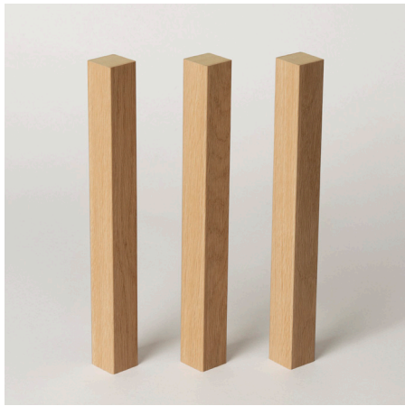
Stix® MR Square 3232 shown in NAVURBAN Diamond™ White Mountain Oak

Square 3232 prefinished, loose decorative battens enable you to explore dynamic architectural wall shapes, ceilings, custom joinery, and seamless finishing.