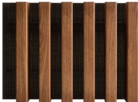
Panels MR Rectangular 5025-6 shown in NAVURBAN Diamond™ Box Wood

An interior prefinished, preassembled acoustic linear batten system. Suitable for horizontal, vertical and curved applications.