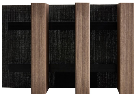
Panels MR Rectangular 9032-3 shown in NAVURBAN™ Birchgrove

An interior prefinished, preassembled acoustic linear batten system. Suitable for horizontal, vertical and curved applications.