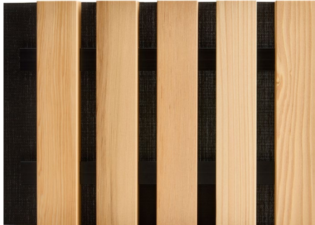
Panels Solid Timber 3040-5 shown in Hemlock, Clear

This prefinished and preassembled acoustic Panels system is meticulously engineered to empower visionary interior design and reduce reverberation in noise-sensitive environments.