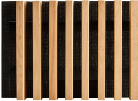
Panels Solid Timber 4020-8 shown in Hemlock, Clear

This prefinished and preassembled acoustic Panels system is meticulously engineered to empower visionary interior design and reduce reverberation in noise-sensitive environments.