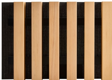
Panels Solid Timber 4030-6 shown in Hemlock, Clear

This prefinished and preassembled acoustic Panels system is meticulously engineered to empower visionary interior design and reduce reverberation in noise-sensitive environments.