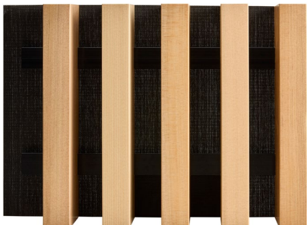
Panels Solid Timber 6030-5 shown in Hemlock, Clear

This prefinished and preassembled acoustic Panels system is meticulously engineered to empower visionary interior design and reduce reverberation in noise-sensitive environments.